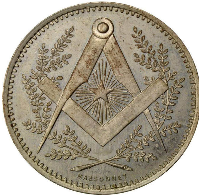
(Above: Jeton of Mt. Sinai Masonic Lodge in France)

The 5-Pointed Star is itself a Masonic emblem. However, the 5-Pointed "FLAMING STAR" is probably an even more special symbol to Masons. I must give credit to LODGE LUZ DO ORIENTE #80, a legal (Regular) Lodge working in Portugal. {Author's disclaimer: I am not claiming that this Lodge is regular nor that it may possibly be considered clandestine in some Jurisdictions. Its mention, here, is solely for reference to worthy topics only}.